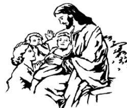
Let the little children come to me...

Eleven children who are participating in the GREAT Program will receive their First Holy Communion on Saturday May 3rd. They and their families have been preparing for this joyous occasion for some time now, learning what the Eucharist is about and what it means to be part of the Eucharist community of people. Please keep them on your prayers.